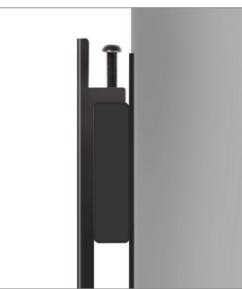
Arms feature levelling screws to adjust the screen height

wall, allowing easy access to connectors